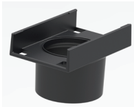
spigot 027 - 000027