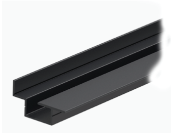
1200 mm collection channel 027 - 000054