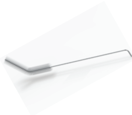
lifting & cleaning brush 060 - 000049

N.B. all parts A.B.S. plastic unless described differer.